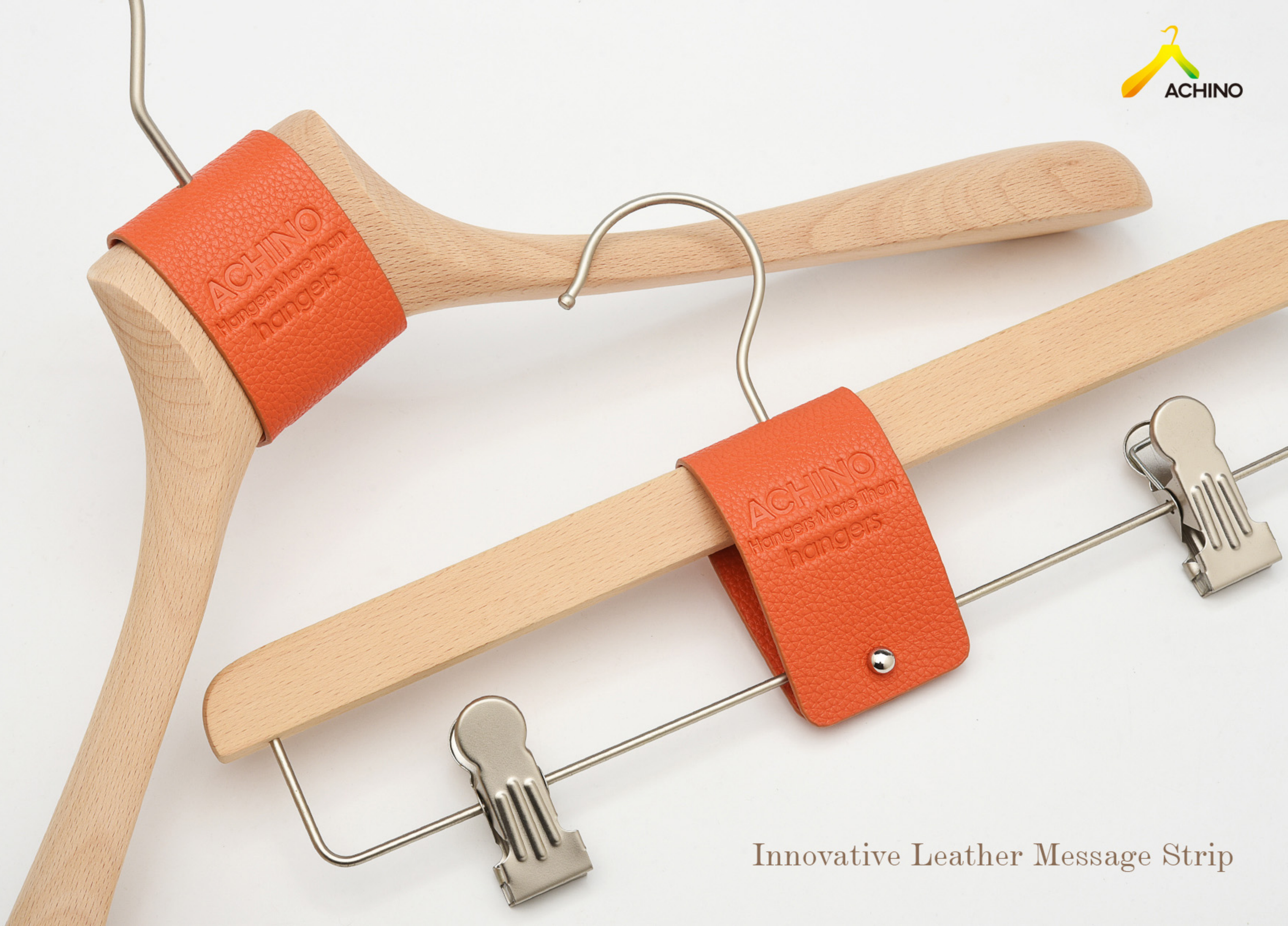
Innovative Leather Message Strip